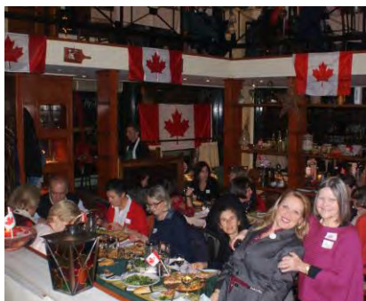
Two storeys of guests celebrate the New Year in Canadian – and Greek – style